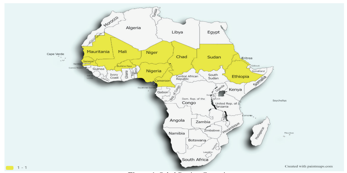
Figure 1. Sahel Region Countries

population expansion, and ineffective governance. Therefore, terrorist organizations seek to target infrastructure and/or services related to food and water in non-conflict areas.<sup>2</sup>